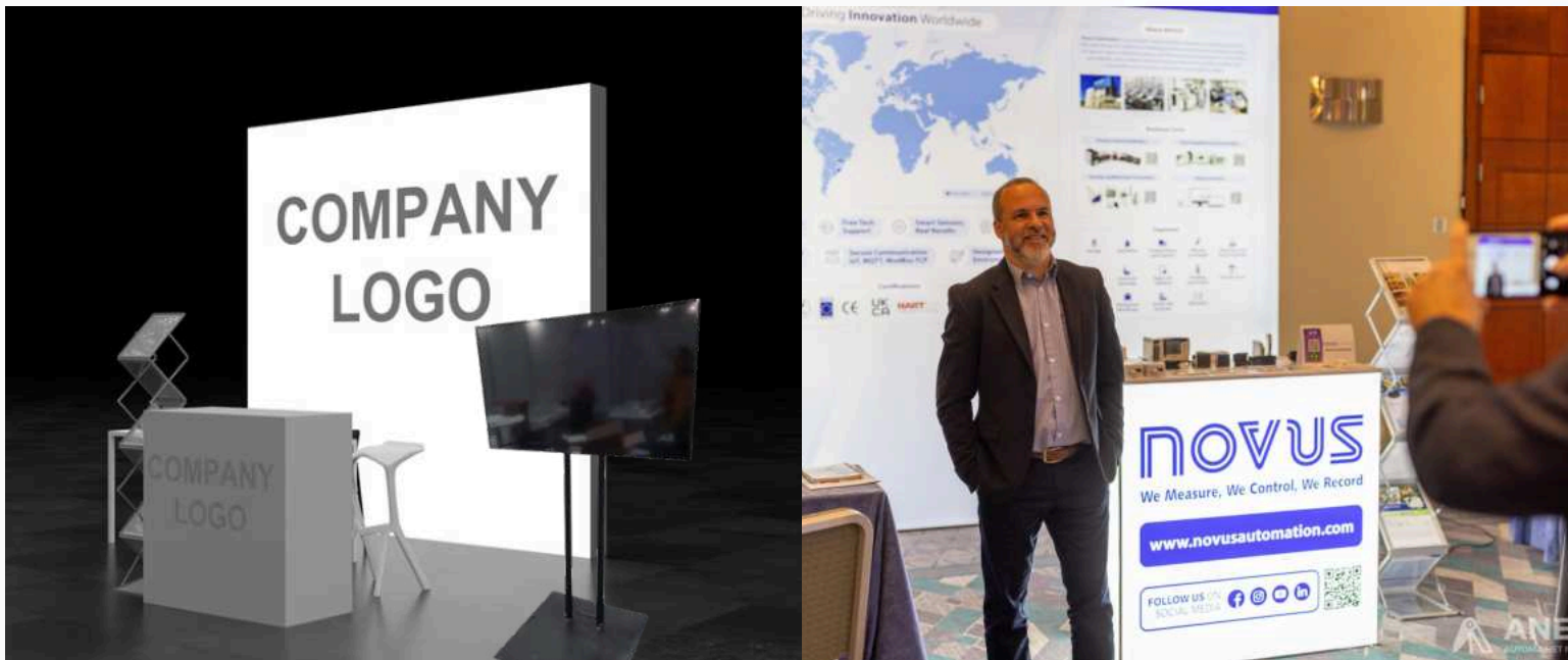
(Example Standard Plus Option)