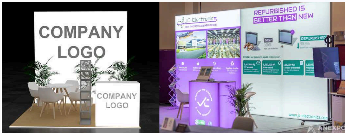
(Example Double Premium Option)