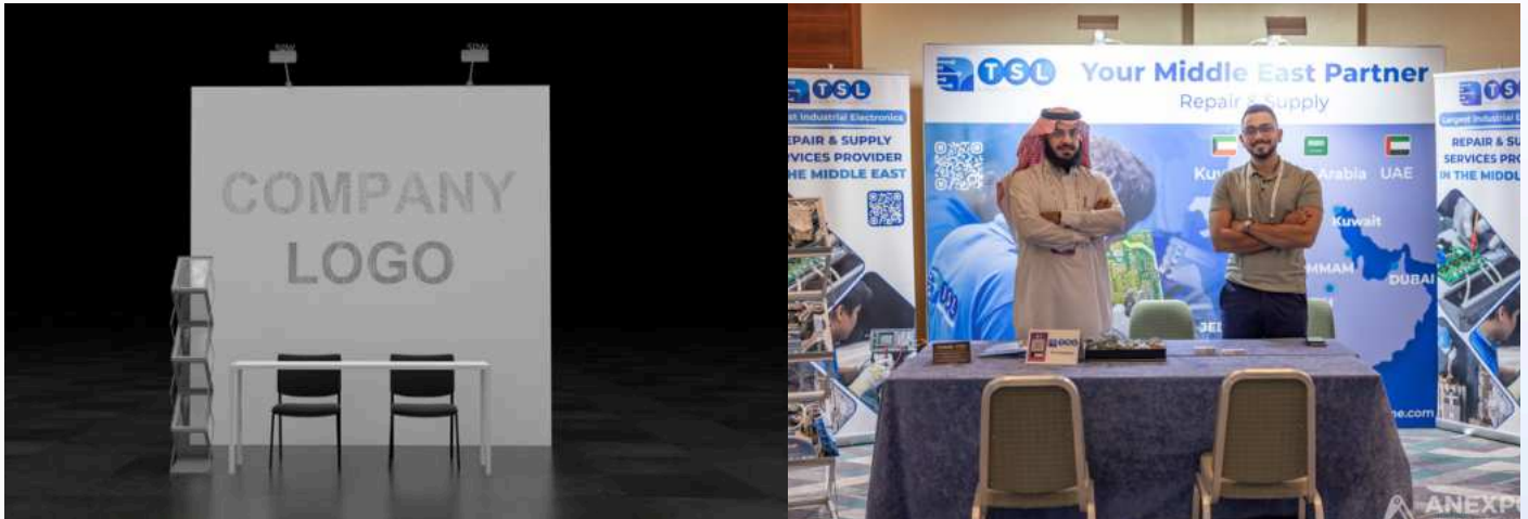
(Example Basic Option)